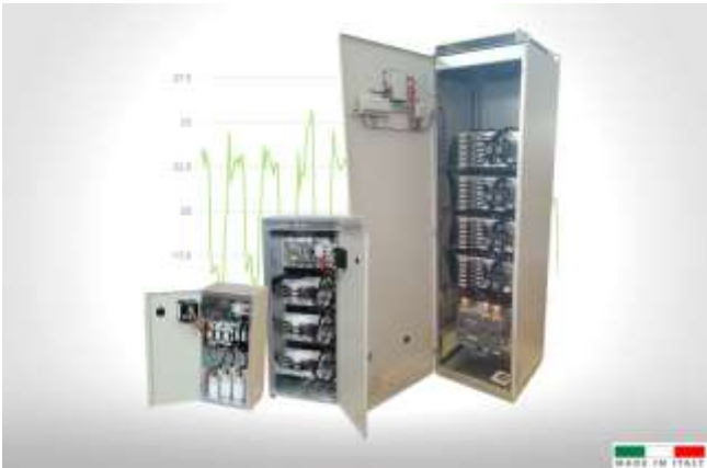
The B35 series are suitable for three-phase networks with an operating voltage of 400 Vac and medium-low harmonic content . Suitable for industrial users with daily work cycles (8h).